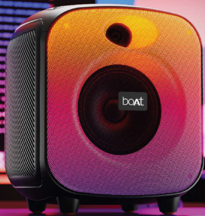
PartyPal 63 Pro